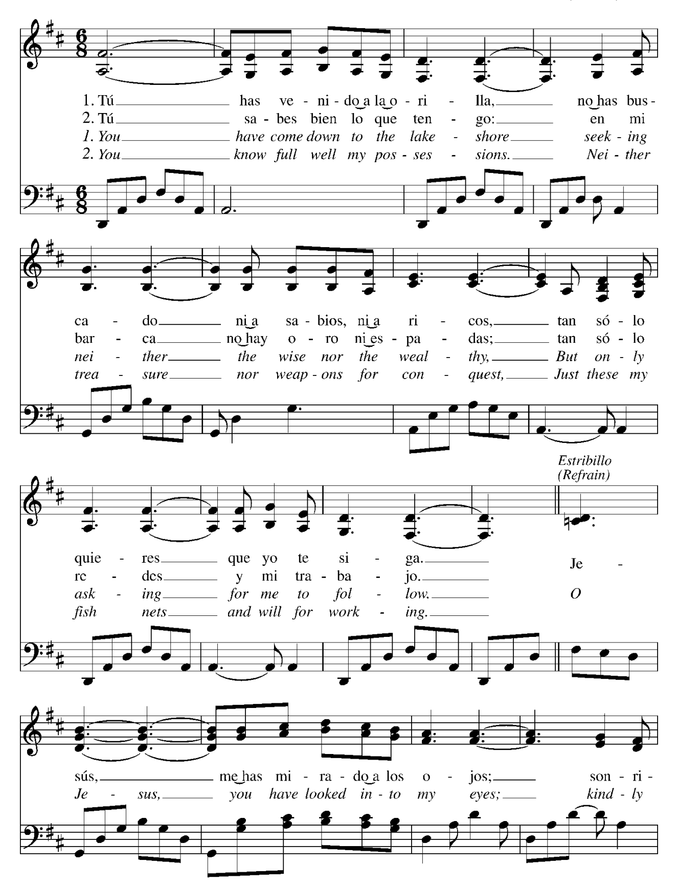
Gradual Hymn 758 "You have come down to the lakeshore" (vv 1 & 2) Pescador from Wonder, Love, and Praise