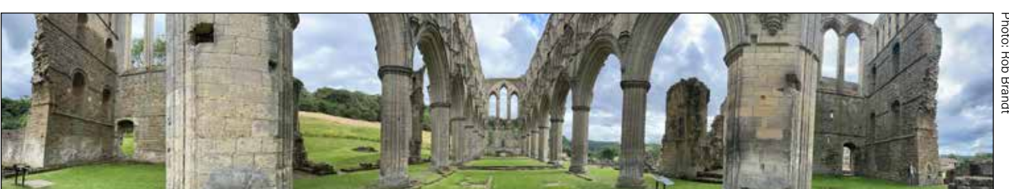
The nave at Rievaulx Abbey, England

I invite you to insert some time of niksen into your life this fall. I will try too, although, I may have to add it to a daily to-do list, so I can check it off at the end of the day. That's not perfectly aligned with the spirit of niksen, but it's a start. Will you join me?.