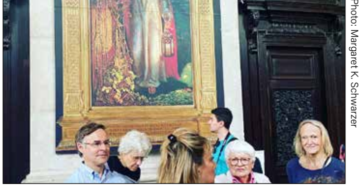
St. Paul's Cathedral, London