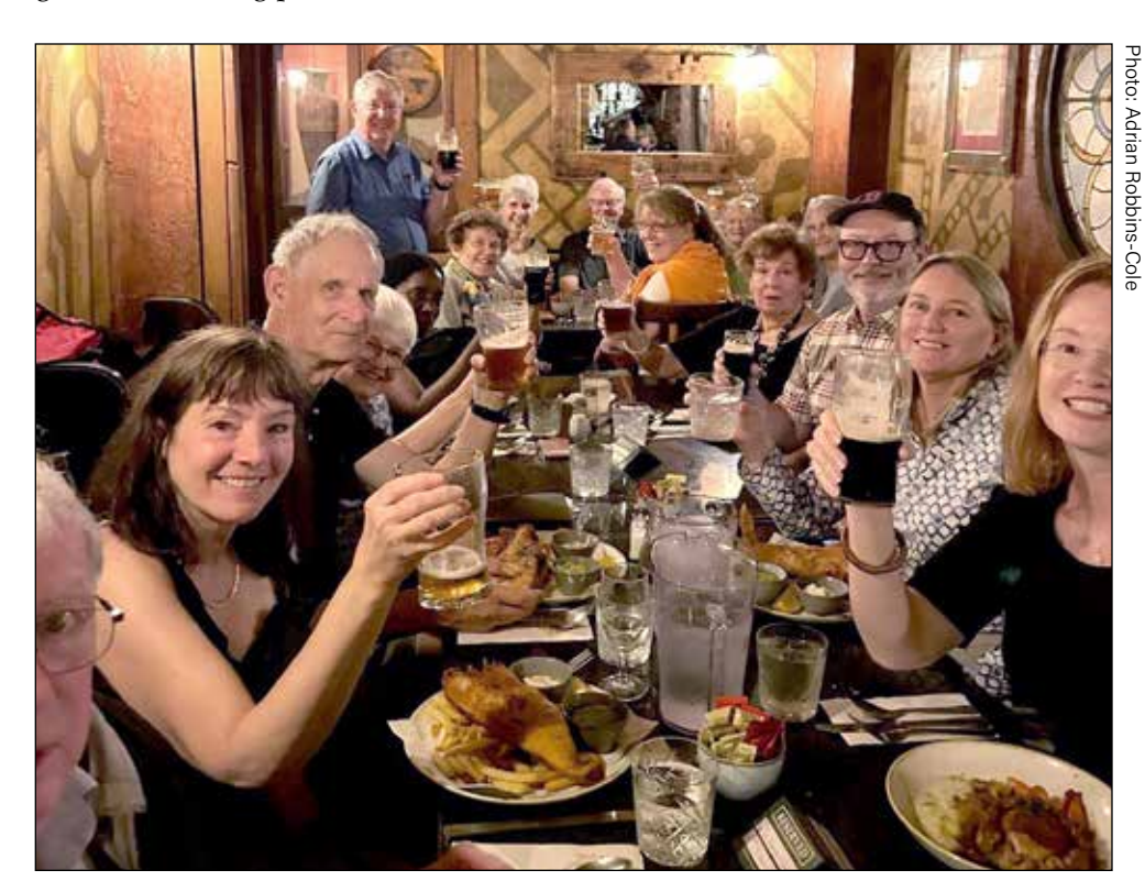
A toast from the parishioners on the 2023 St. Andrew's pilgrimage to England

St. Andrew's doesn't feel smaller to me, but its homey quality feels good to come back to. The particulars of our community—including our beautiful building, our choir, our stained glass, our parish hall, our members—are just what I need to encourage my own faith to flourish. The particulars make all the difference.