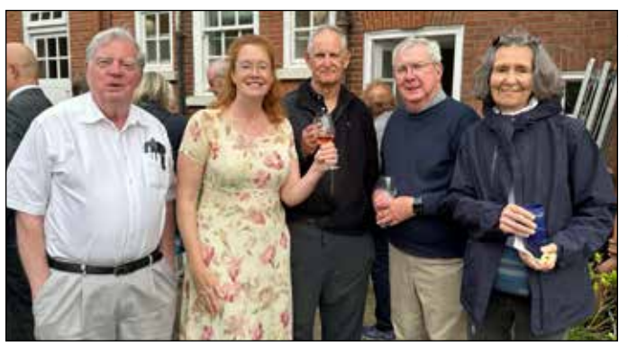
Dean's cocktail party, York Minster