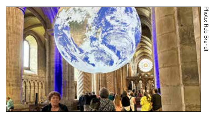
Durham Cathedral's environmental art display