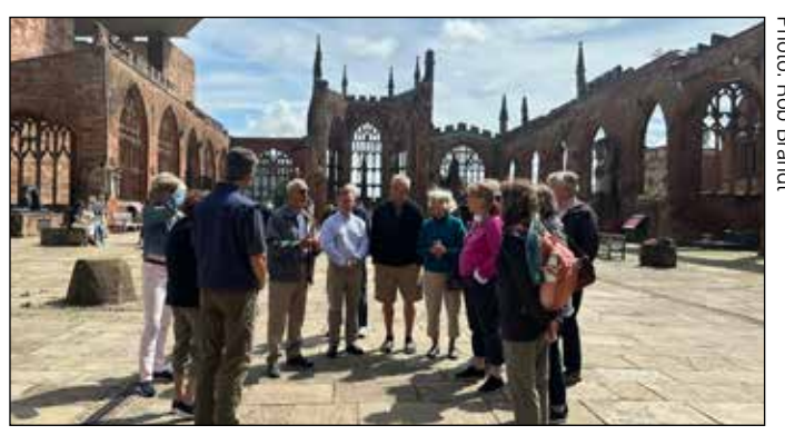
Ruins of Coventry Cathedral