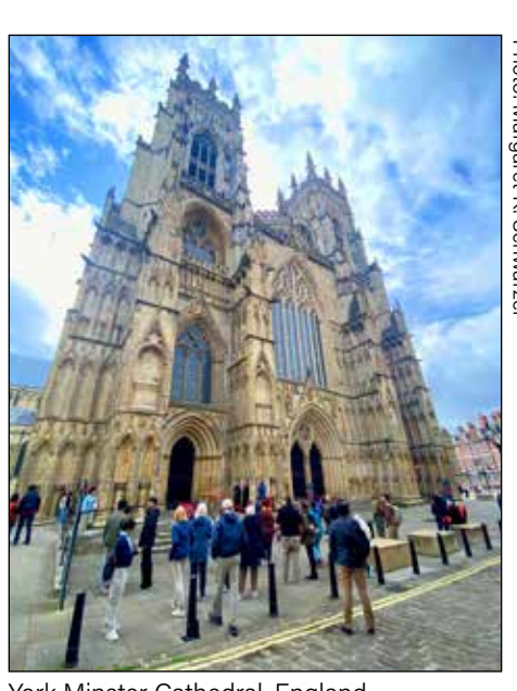
York Minster Cathedral, England