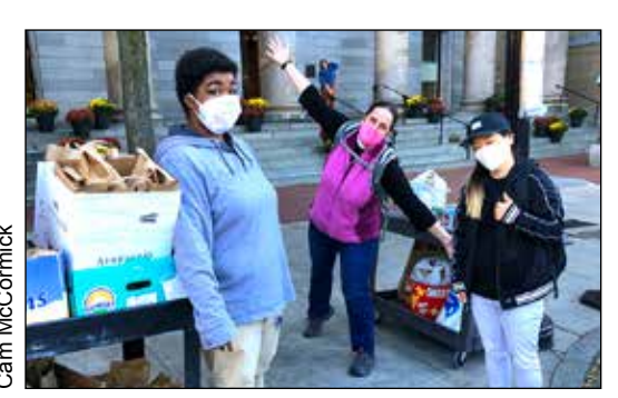
Serving common cathedral lunches

We are eager for more new ways to expand our work, engage with new communities, and broaden our own horizons. See the outreach section of our website standrewswellesley.org/outreach to see how you can apply for a grant in 2022.