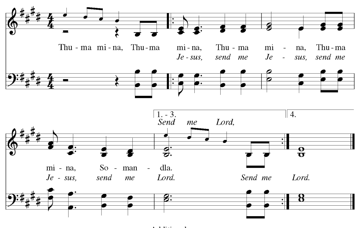
Additional verses 3. Call: Lead me, Lord, Response: Lead me, Jesus. 4. Call: Fill me, Lord, Response: Fill me, Jesus.

South African from Wonder Love and Praise, 808