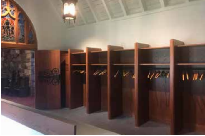
The new narthax entrance to the church sanctuary

In sum, I'm looking forward to experiencing the essence of "being church" together and sharing the love of Christ with one another. I'm looking forward to returning to the interdependent community life of our thriving parish while we are recognizing its value and participating in it fully—knowing its many blessings "for the first time."